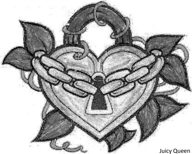
Juicy Queen Bee