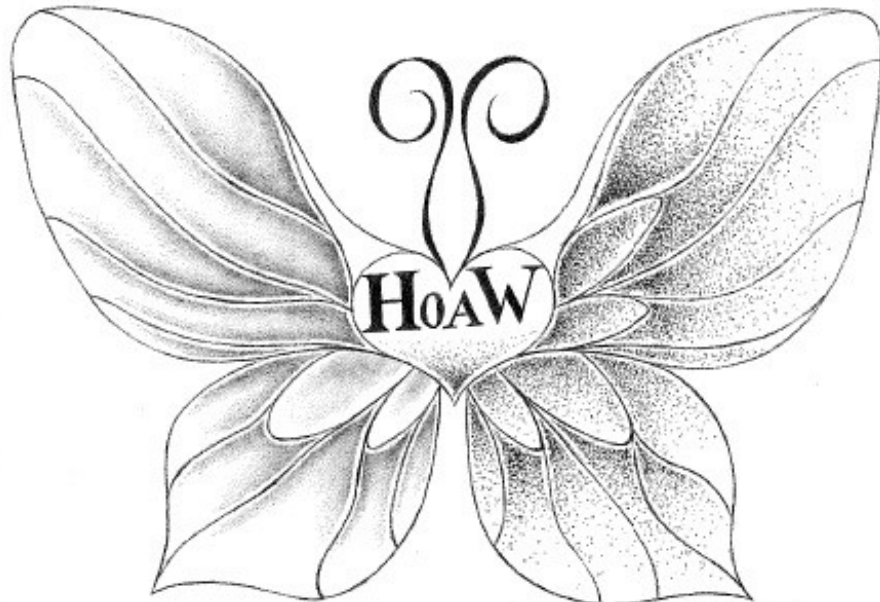
J.E. Forbes, FG-4445, 2015